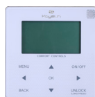
KCCHT-06 MODBUS Standard